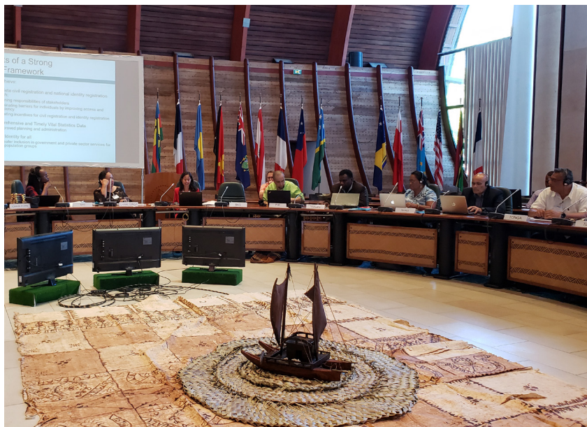
GHAI presents at the Pacific Regional Workshop on Legal Identity in 2019.

We provide legal review for Bloomberg Philanthropies' Data for Health initiative to improve public health data so that governments are equipped with the tools and systems to collect and use data to prioritize health challenges, develop policies, deploy resources and measure access.