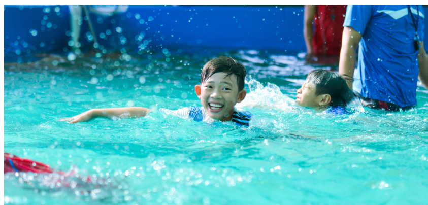
Children learning to swim in Vietnam.

Drowning is one of the leading causes of death among children globally, especially in Asia and Africa. The Global Health Advocacy Incubator (GHA) supports governments to test and implement proven drowning prevention interventions and works with local communities to create awareness and generate demand for services to achieve sustainable drowning prevention programs.